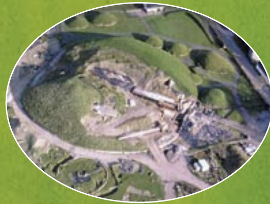
Tochailt Chnóbha The excavation of Knowth

Pleananna comparáideacha de cairn mhóra Bhrú na Bóinne