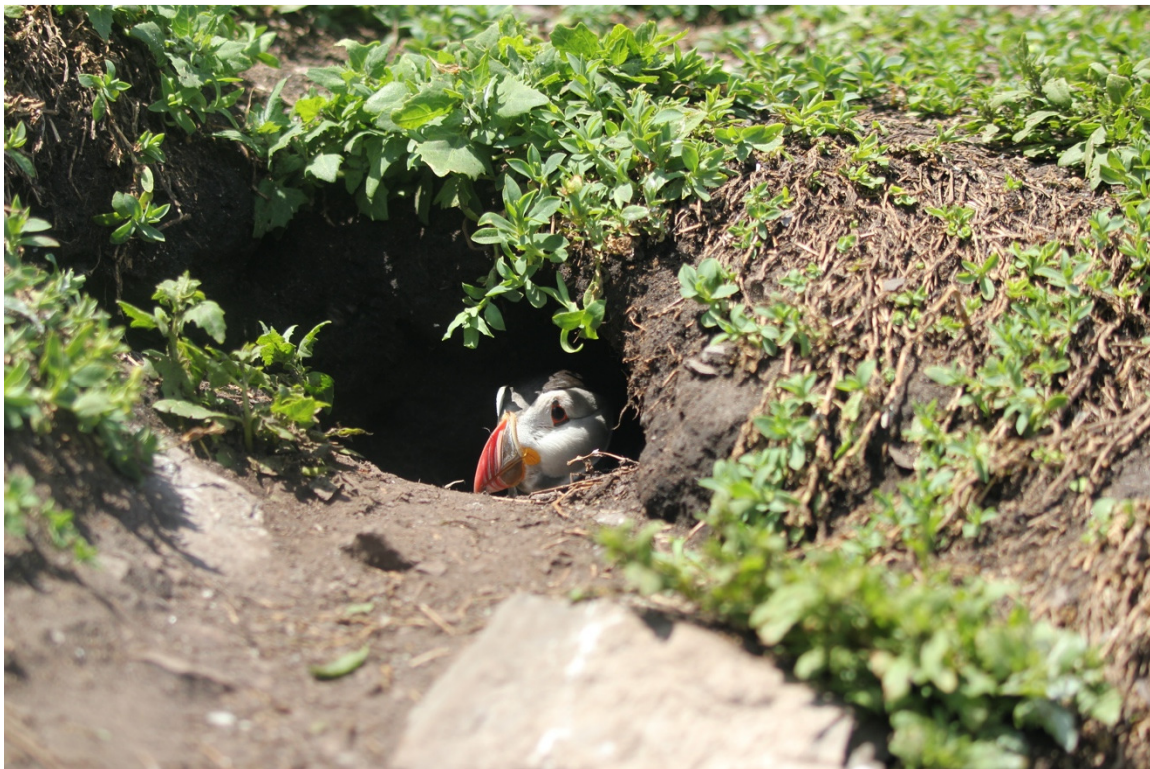
Puffin burrows away from the stone steps are often quite shallow and would be liable to collapse were visitors given free reign of the island.

Skellig Michael's cultural and natural heritage are often intertwined, with puffins, European storm petrels, and Manx shearwaters nesting in gaps in the stone walls, steps, and monastic structures. The number of visitors to the island is restricted to protect both natural and cultural features of the site. The regulation of visitors has helped keep the island free from rats and other introduced predators, which can quickly deplete breeding seabird numbers (Jones et al. 2008). Tourists are restricted to well defined paths, which means that the natural burrows in the shallow soil are mostly safe from collapse from stray footfall.