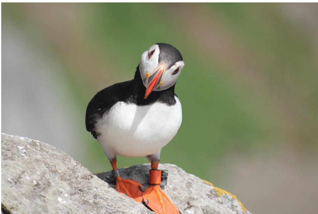
Geolocator device on the left leg on a puffin on Skellig Michael

In recent years, the advent of biologging technology has allowed us to fill some of the knowledge gaps of puffin ecology. Geolocator devices, weighing 1-2g were first deployed on Irish Atlantic puffins in 2010, when researchers from UCC attached tags to puffins on Skellig Michael. These devices record light levels, and the location of the bird can then be inferred from the timing of sunrise and sunset. The level of error in these location estimates is high, but broad-scale movements can be determined.