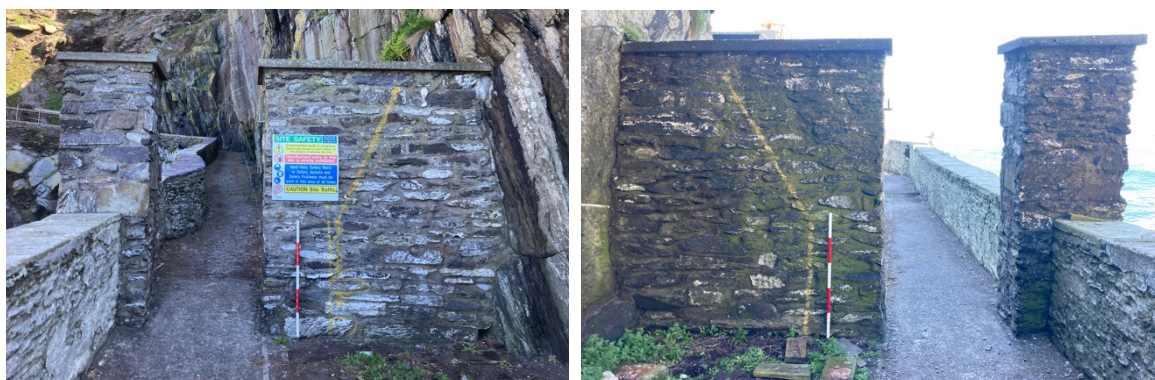
The north gateway of the Lower Light Station (l) south face (r.) north face, showing area to be removed (yellow line).

The wall containing the gateway and a corresponding wall and gateway at the south side of the Lower Light Station were erected by CIL between 1986 and 1988 to separate the Lower Light Station from the rest of the island when the lighthouse was being automated and after the State had gained possession of most of the rest of the island.